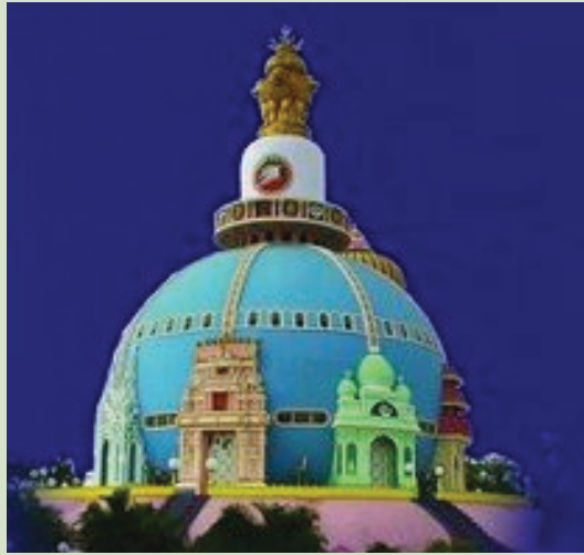
Universal Integration Pillar, Viswanagar, India