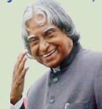
Dr. APJ Abdul Kalam